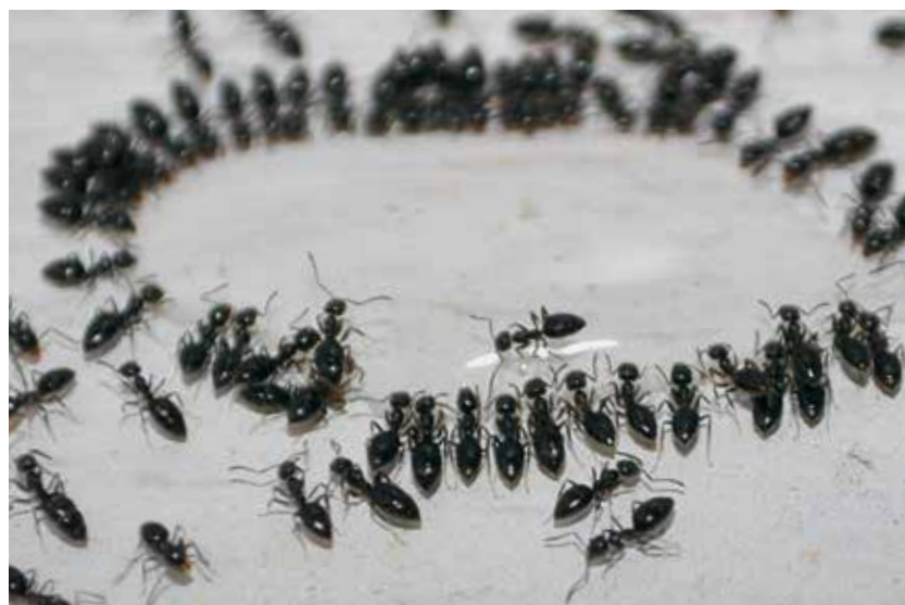
Black House Ant ( Ochetellus Glaber ) feeding on Maxforce Quantum

* Note: Whilst certain protein feeders will feed on sugary liquids there are other protein-feeding ants for which granular protein based baits are still the best choice for control, especially in outdoor areas.